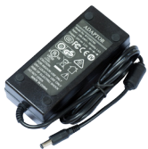
24V 2.5 A power adapter