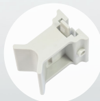
Mounting pole bracket