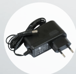
24V 0.38A Adapter