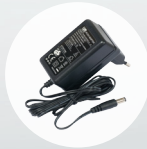
24V 0.8A Adapter