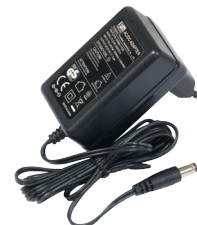
24V 0.8A Power adapter